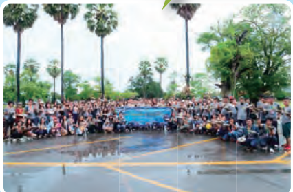
Nikkei Siam Aluminium Ltd. (Thailand)