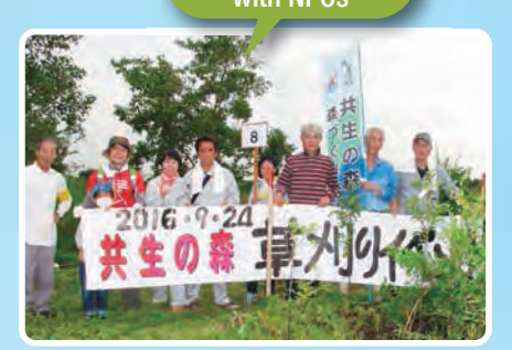
Participation in the creation of Kyosei no Moril (forest of coexistence) by Nikkei Technology Center Co., Ltd.