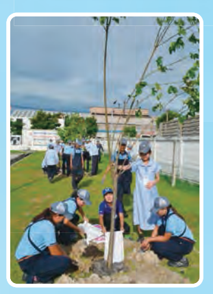
Amata Nakorn Factory of Nikkei Siam Aluminium Ltd. (Thailand)