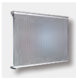
All aluminum heat exchanger

Through the widespread use of heat exchangers with high energy-saving effects, I have been able to help make people's living environments more comfortable in Southeast Asia and have been filled with a stronger sense of pride and responsibility.