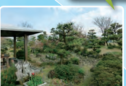
Nikkei Niigata Co., Ltd.