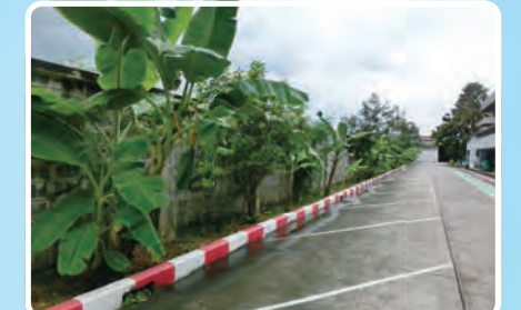
Fruehauf Mahajak Co., Ltd. (Thailand)