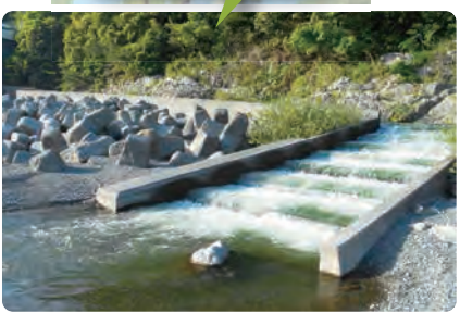
Fishway that was constructed in Toshima Dam