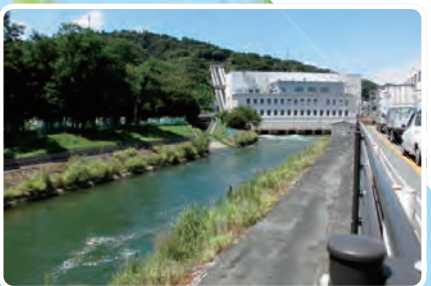
Kambara Complex of Nippon Light Metal Co., Ltd.