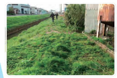
Patrol of the outer perimeter of the factory by Toyo Rikagaku Kenkyusho Co., Ltd.