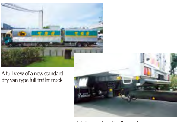
Joining section of trailer truck